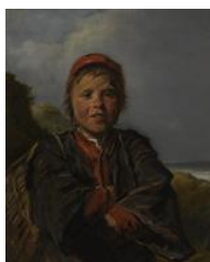
Frans Hals Fisherboy , 1632/33 © KMSKA – Lukas-Art in Flanders vzw Photo: Hugo Maertens