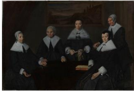
Frans Hals Regentesses of the Old Men's Alms House, c. 1664 Frans Hals Museum, Haarlem