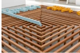
Riet Wijnen Sculpture Sixteen Conversations on Abstraction (detail), 2016