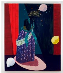
Kerry James Marshall Untitled (Beauty Queen) , 2014 Acrylic and glitter on PVC panel 71 3/4 x 59 7/8 inches 182.2 x 152 cm © Kerry James Marshall Courtesy the artist and David Zwirner, London