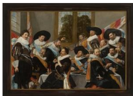
Frans Hals Banquet of the Officers of the Calivermen Civic Guard, 1627 Frans Hals Museum, Haarlem