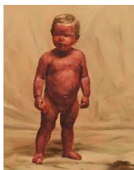
Michaël Borremans Fire from the Sun , 2017 Courtesy Zeno X Gallery, Antwerp Photo: Peter Cox