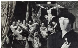
Luuk Wilmering The Civic Guard Portrait Groups, 2015 Series of 6 collages