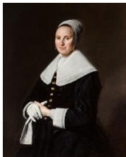
Frans Hals Portrait of a Lady with Gloves, c. 1645/50 Frans Hals Museum, Haarlem