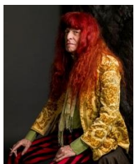
Koos Breukel Armand, Amsterdam , 2015 ©Koos Breukel