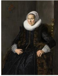
Frans Hals Portrait of Cornelia Vooght, 1631 Frans Hals Museum, Haarlem