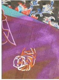
Shezad Dawood The King of France (after Hals, Braque and Raysse) Acrylic and neon on vintage textile and canvas Detail 154x119 cm Courtesy Shezad Dawood and HE.RO, Amsterdam